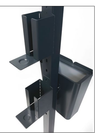
Clean dispenser holder, Small, Large and Hold mini.