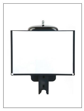
Clean sign holder A4.