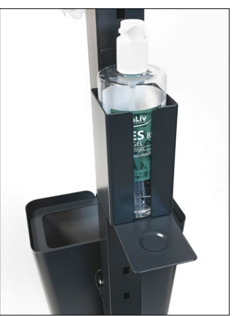
Clean dispenser holder, Small.