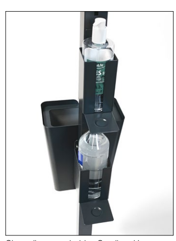
Clean dispenser holder, Small and Large.