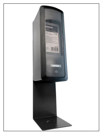
Clean bracket Katrin touchfree dispenser. Dispenser not included*.