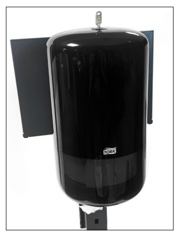
Clean bracket Tork M1, Tork M1 not included*.