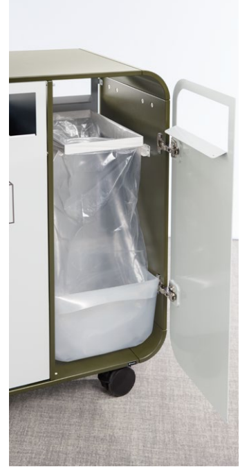
Moisture protection, square.