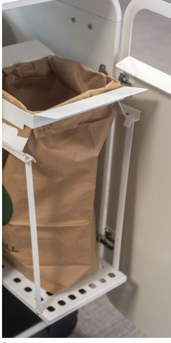
Bag holder food waste, adjustable in height 338-448 mm. Adapted for recycling bag 45 L.