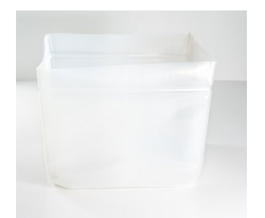
Moisture protection, square.