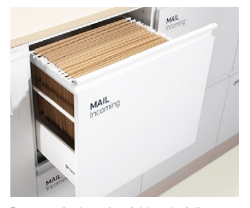
Drawers for hanging folders in folio format, 365x240 mm, c/c 390 mm. Folders are available as accessories.

Drawer adapted to the Mail's plastic tray.