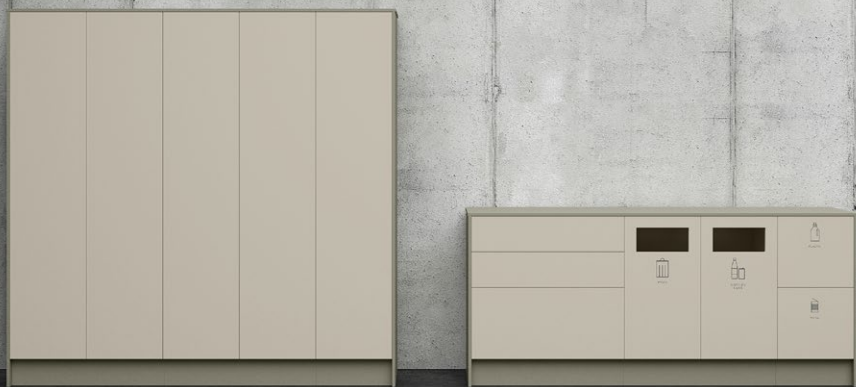
Cabinet & Recycling unit