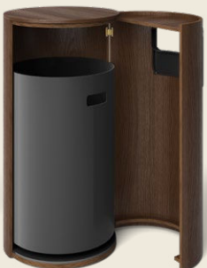
Etage 870 + planter