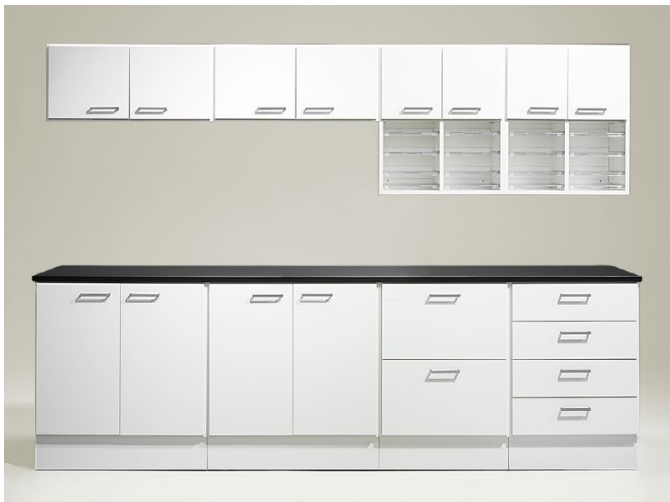
Copy station 1. Ready combination, consisting of cabinets, wall cupboards and mail shelves. Length 2800 mm.