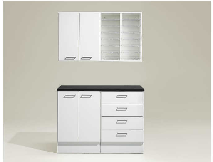
Copy station 4. Ready combination consisting of cabinets, wall cupboards and mail shelves. Length 1220 mm.