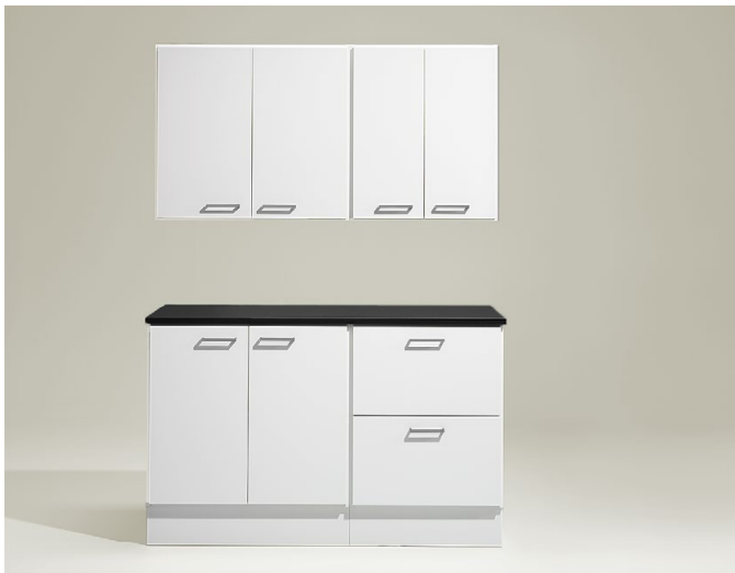
Copy station 3. Ready combination consisting of cabinets and wall cupboards. Length 1420 mm.