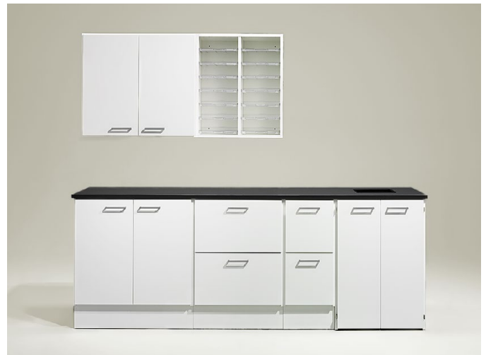
Copy station 2. Ready combination consisting of cabinets, wall cupboards, mail shelves and recycling unit. Length 2380 mm. Recycling container not incl., available as an accessory.