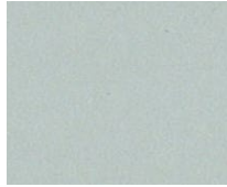
Light grey (U12188)