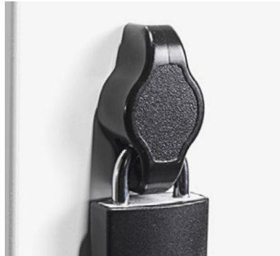
Padlock fittings, excl. padlocks.