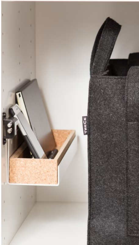
Stuff cork box and shelf keeps smaller items in order.

NCS refers to product lacquered in one optional NCS color.