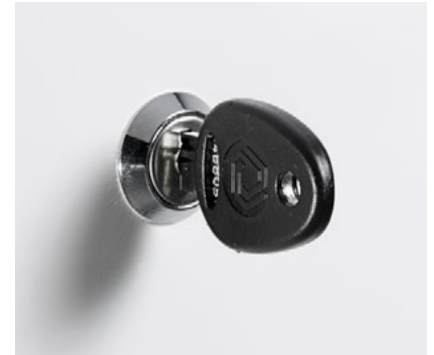
Cabinet lock as standard, incl. 2 keys.