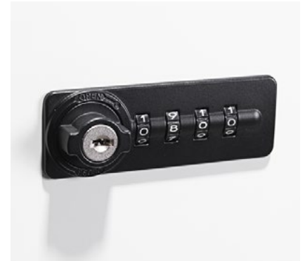
Code lock/personal storage.