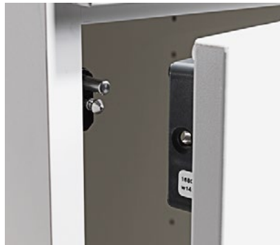
RFID-locks EM or Mifare.