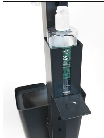
Clean dispenser holder, Small.