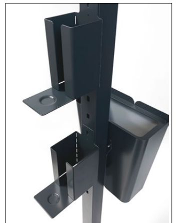
Clean dispenser holder, Small, Large and Hold mini.

* You buy Tork M1 and Katrin Touchfree Dispenser from your daily office supplier.