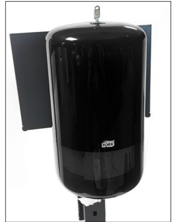
Clean bracket Tork M1, Tork M1 not included*.