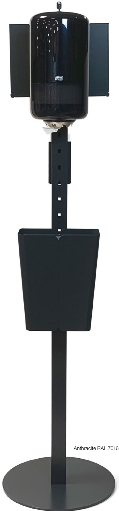
Anthracite RAL 7016