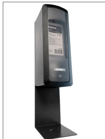
Clean bracket Katrin touchfree dispenser. Dispenser not included*.