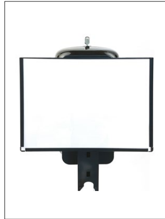
Clean sign holder A4.