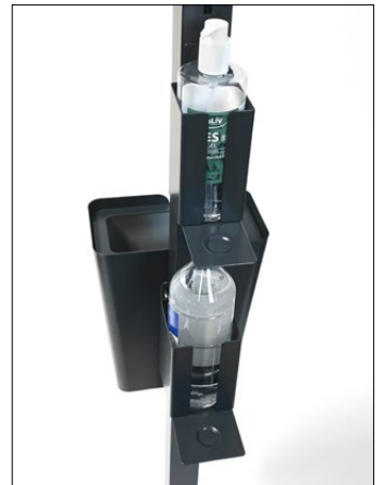
Clean dispenser holder, Small and Large.