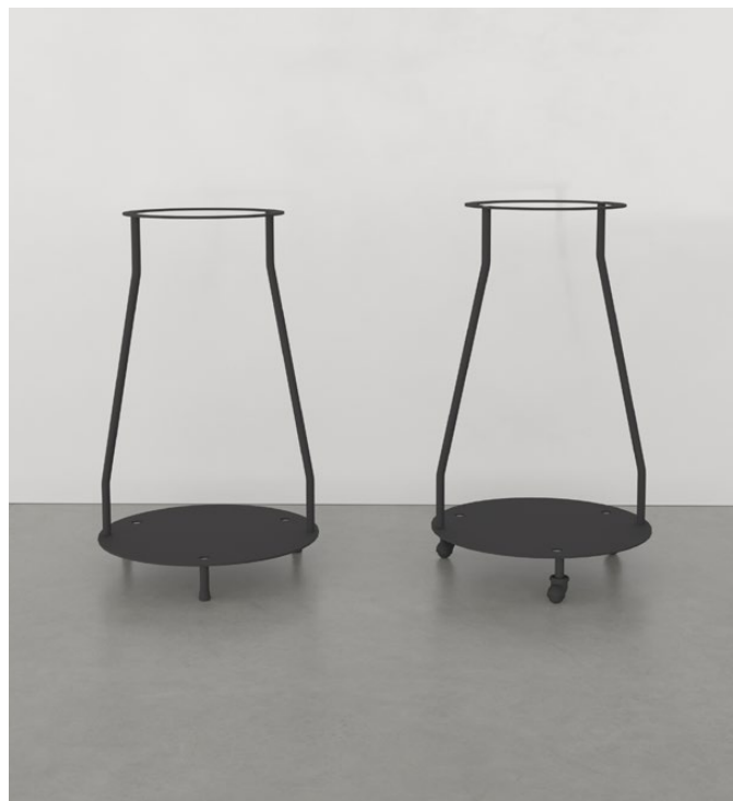
Black inner frame in RAL 9005.