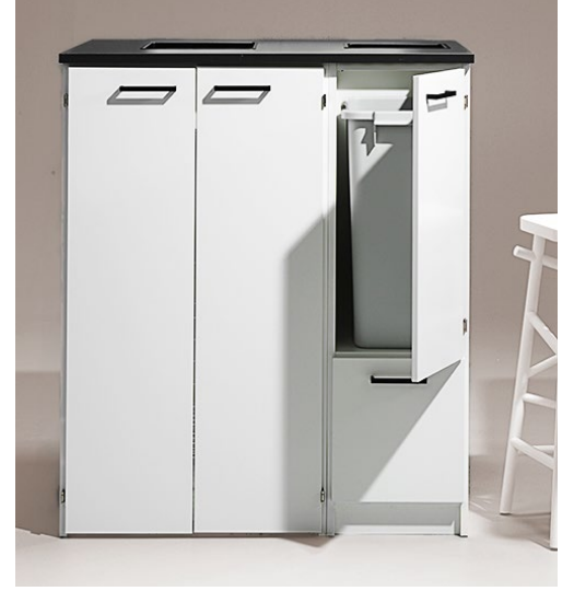
Recycling station with container 60 L.