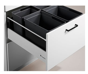
Container 2x19, 2x10 L.