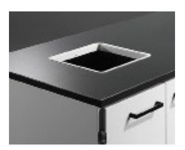
Inlet with lacquered frame in steel, 250x250 mm.