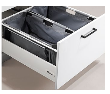
Waste bag 2x25 L. Washable fabric with rubberized inside.