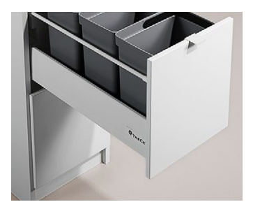
Container 3x10 L.