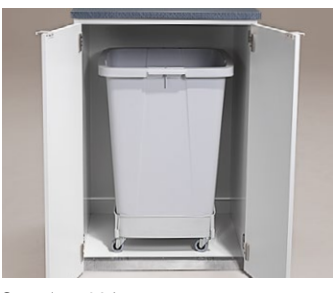
Container 90 L + cart.