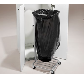
Bag holder, 60-125 L.