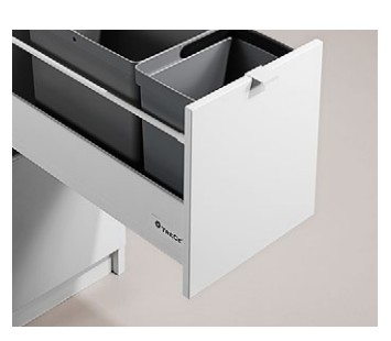
Container 19+10 L.