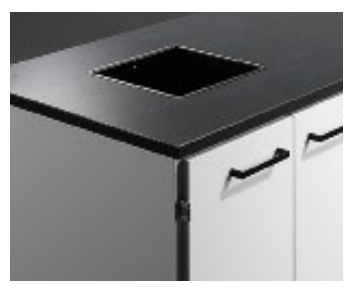
Inlet with lacquered frame in steel, 250x250 mm.