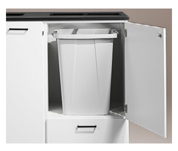
Container 90 L.