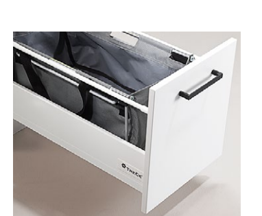
Waste bag 25 L.