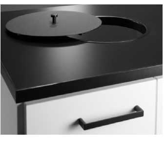
Lid for round inlet.