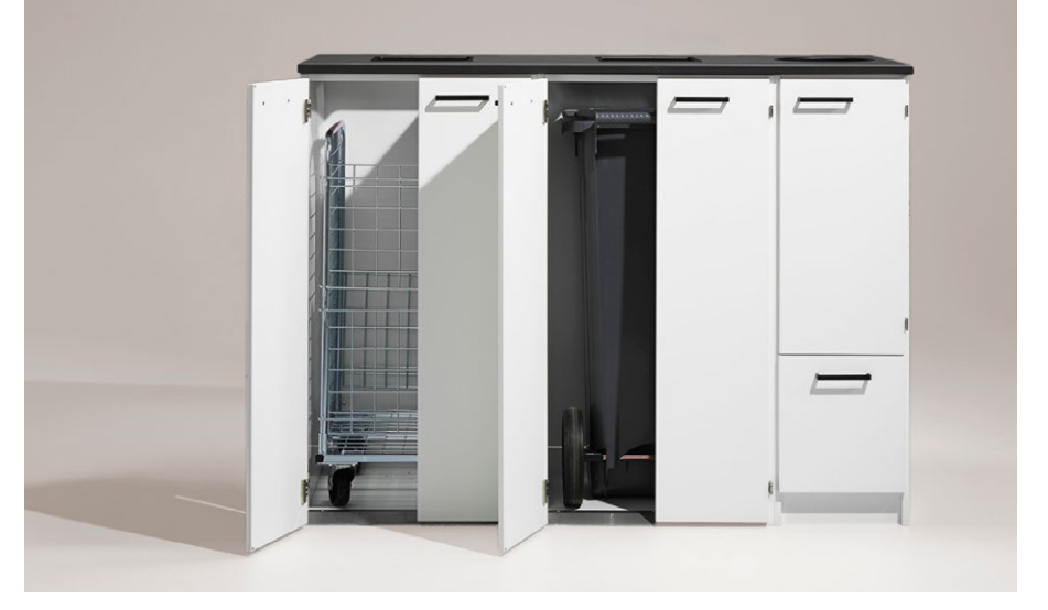
Recycling station with cardboard cart and recycling container on wheels.