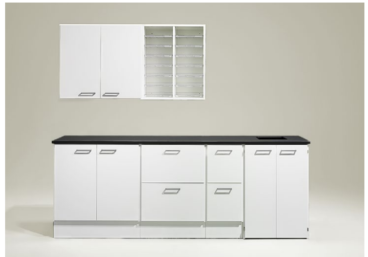
Copy station 2. Ready combination consisting of cabinets, wall cupboards, mail shelves and recycling unit. Length 2380 mm. Recycling container not incl., available as an accessory.