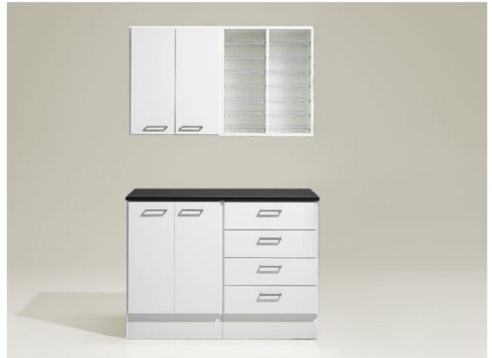
Copy station 4. Ready combination consisting of cabinets, wall cupboards and mail shelves. Length 1220 mm.