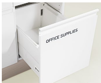
Storage suitable for envelopes, etc.