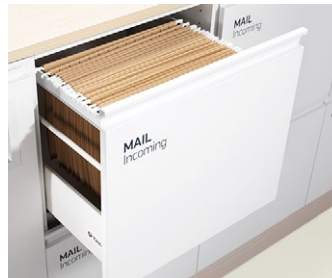
Drawers for hanging folders in folio format, 365x240 mm, c/c 390 mm. Folders are available as accessories.