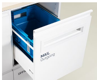
Drawer adapted to the Mail's plastic tray.