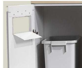
Door with inlet, 60-litres container included.