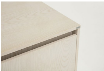
Distance between door and frame for ventilation.