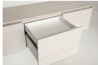
Soft has a drawer in the drawer for a clean outside and a functional inside.