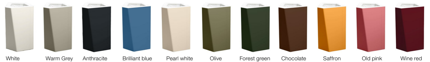
White Warm Grey Anthracite Brilliant blue Pearl white Olive Forest green Chocolate Saffron Old pink Wine red

Width: 250 mm, 9.8" | Height: 355 mm, 13.9" | Depth: 245 mm, 9.6" | Frame: Made of shock-resistant powder coated steel (10L volym). | Lid: In white or anthracite. Vacuum foiled MDF with screen printed symbol. | Base: ABS plastic made from 100% recycled material. | Wall mount: Right or left. Wall mount is included in Kite mini wall.